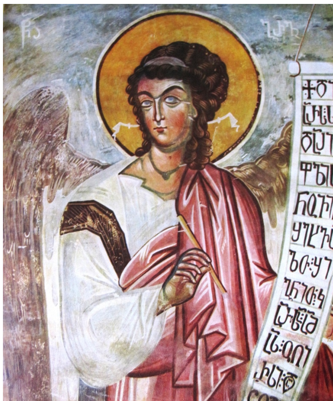
Fig. 6. Tsalenjikha, Church of the Savior, western nave, Archangel Gabriel (detail).

the commemorative inscription set up for Eudemon (“Remember | the soul | of your servant | Eudemon | the Archpriest”) was written in Greek (“Μνήσθητι... | την ψυχήν... | τοῦ δούλου | σου Ευδέμωνος | ἀρχιερέως”). 23