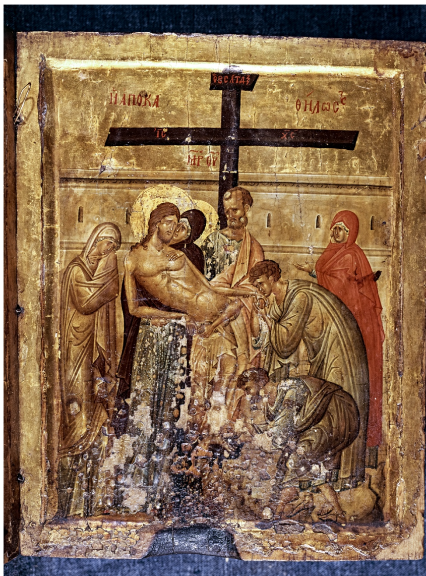
Fig. 5. Sinai, Saint Catherine's Monastery, Diptych with the Virgin Hodegetria and the Deposition from the Cross, right leaf.

“alt=Image of a painted panel with a gold background that depicts the elongated body of the dead Christ being taken down from the Cross surrounded by mourning figures”