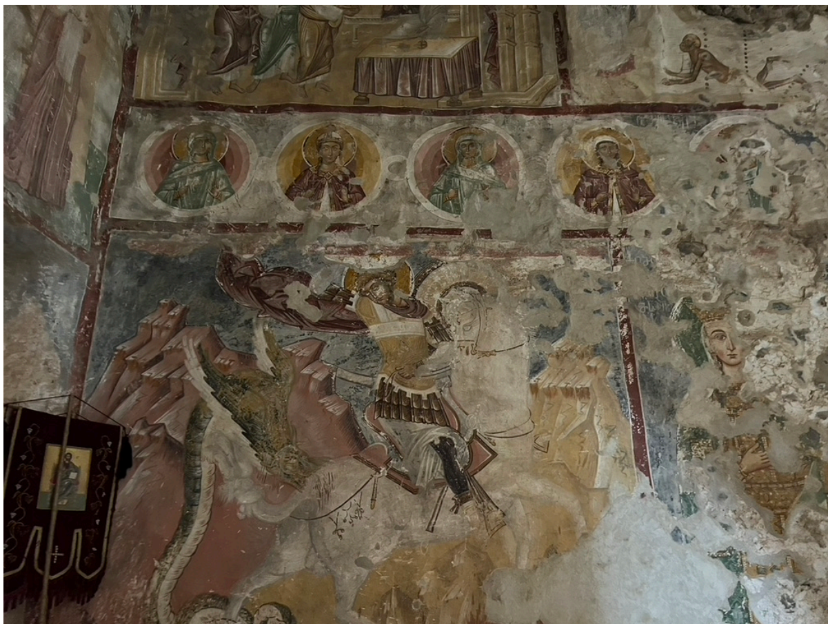
Fig. 4. Tsalenjikha, Church of the Savior, northern aisle, St George slaying a dragon (left) and a portion of the donor portrait of the Dadiani family (right).

“alt=Image of a damaged fresco divided into several compartments. On the left, the image of a saint in military garb and with a billowing cloak mounted on a white horse and spearing a dragon coiled below him. On the right, the image of a standing woman wearing formal robes reminiscent of imperial regalia”