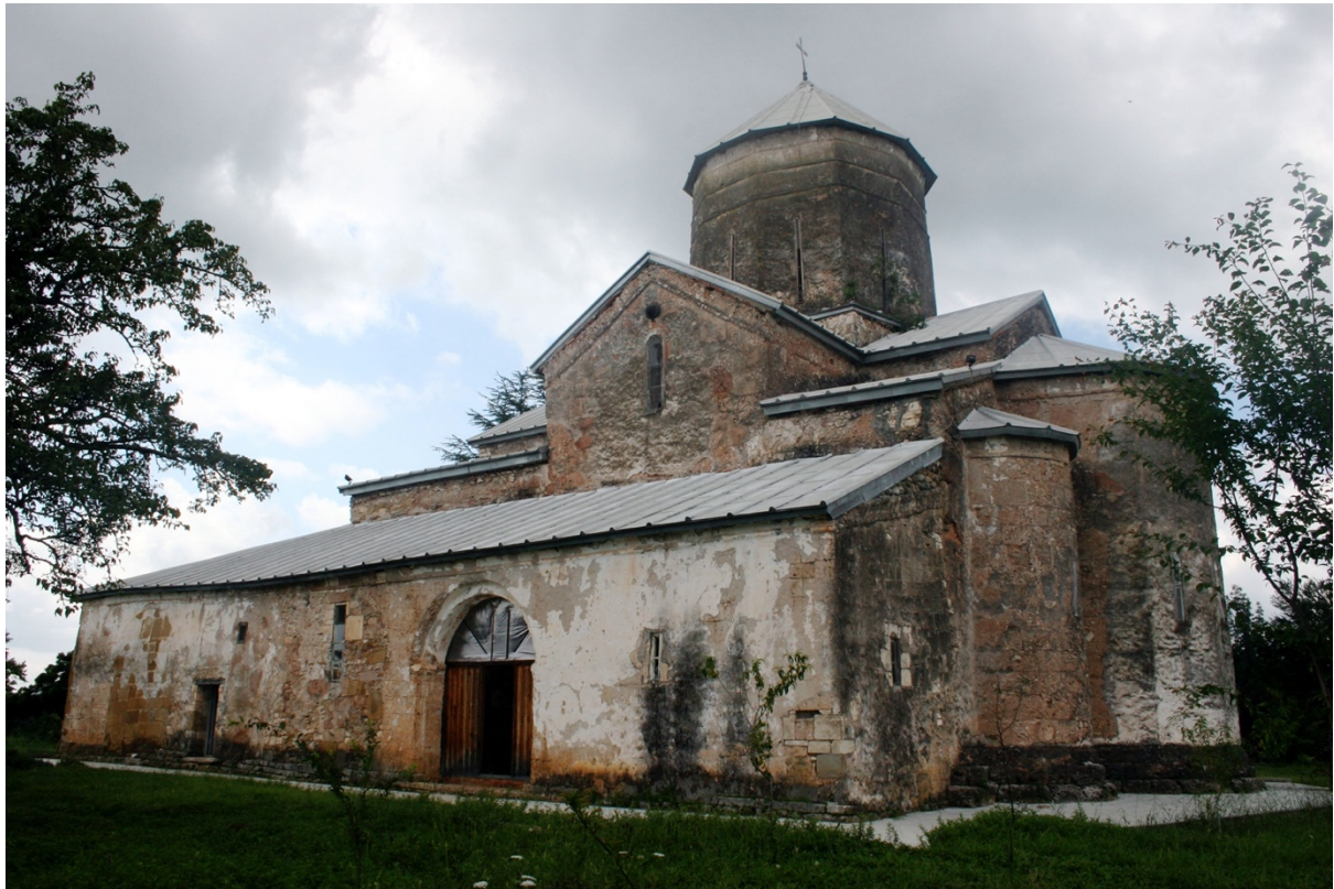
Fig. 1. Tsalenjikha, Exterior of the Church of the Savior, viewed from the south-east.

Title: The Frescoes of Manuel Eugenikos of Constantinople and His Byzantino-Georgian Atelier at the Church of the Savior at Tsalenjikha Date: Main phase late 14 th -early 15 th century Geography: Samegrelo-Zemo Svaneti, Georgia Culture: Byzantine-Georgian Medium: Architecture and wall painting